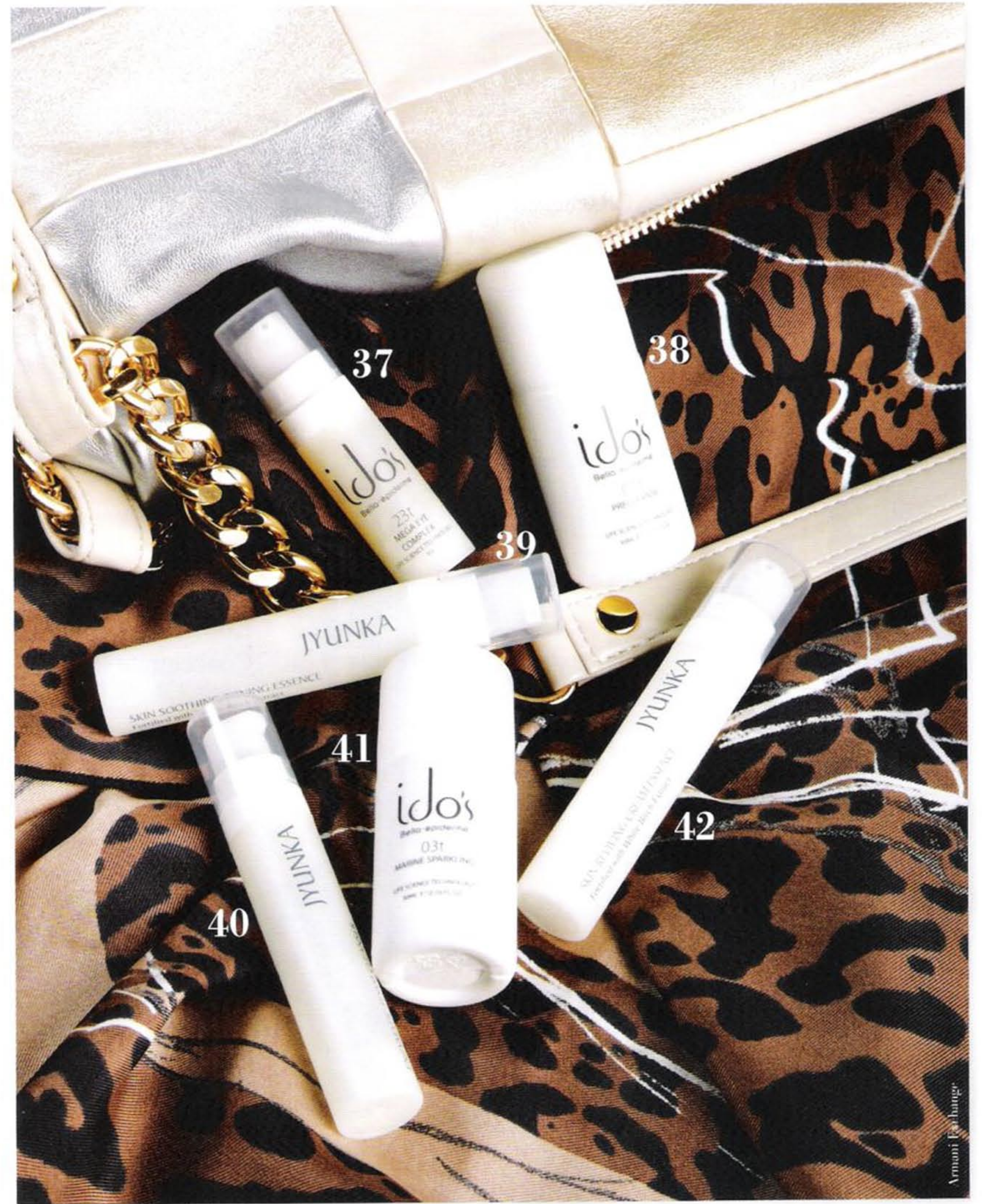
37 ido's Mega Eye Complex 眼部精华 38 ido's Precleanse 洁面霜 39 Jyunka Skin Soothing Toning Essence 舒缓化妆水 40 Jyunka Enzymatic Foam Cleanser 泡沫洁面霜 41 ido's Marine Sparkling 保湿液 42 Jyunka Skin Reviving Cream Essence 活肤精华霜